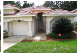
34304 Perfect 224,000