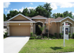
12330 Woodlands 325,000