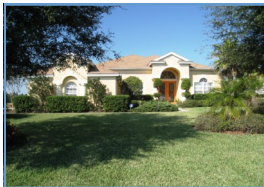
13029 Thoroughbred 419,000