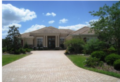
33838 Americana 789,000 PENDING