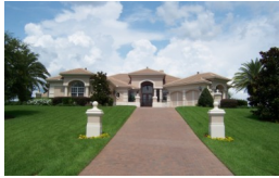
12911 Ventana 1,100,000

The Coldwell Banker Previews Program is designed to market luxury residential properties. To conform to the Previews criteria, a home must meet stringent standards of quality and exclusivity. These properties meet those standards and I am proud to include these fine homes in my inventory.