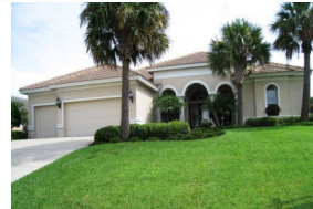
34019 Americana 450,000 SOLD