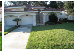
34312 Perfect 210,000 SOLD

VISIT MY WEBSITE AT WWW.ILOVELAKEJOVITA.COM FOR A VISUAL TOUR OF EACH OF MY LISTINGS