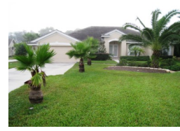
12606 Grand Traverse 379,000