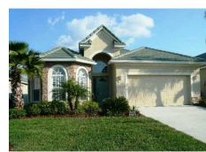
13234 Palmilla 245,000 PENDING