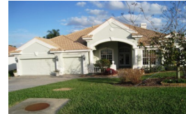
12810 Grand Traverse 749,000