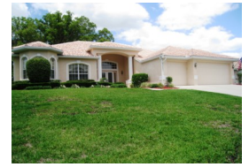
12703 Oak Hollow 440,000