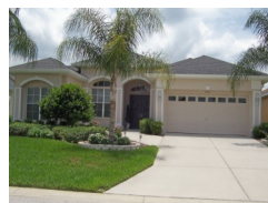
12354 Forest Highlands 339,900