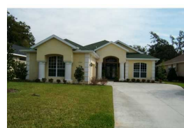
12502 Forest Highlands 349,000