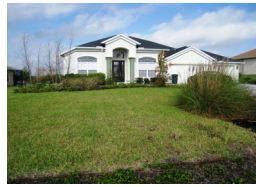
13119 Thoroughbred 399,000