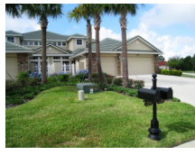
13209 Palmilla 249,000