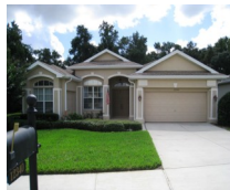
12340 Woodlands 299,000 PENDING