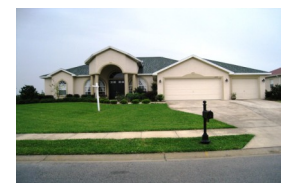
13612 Thoroughbred 299,000