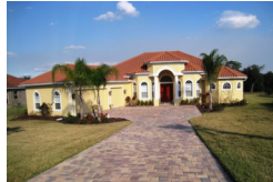
12836 Grand Traverse 749,900