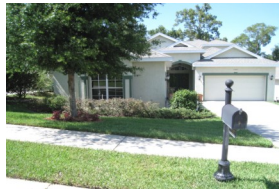
12247 Forest Highlands 473,900