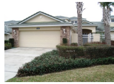
13147 Palmilla 225,000