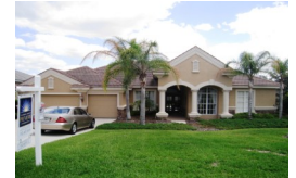
12700 Grand Traverse 715,000