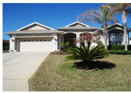
12413 Woodlands 360,000