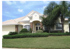
12620 Lake Jovita 450,000