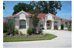
12742 Lake Jovita 369,000