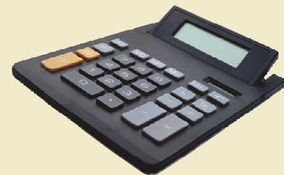
Figure out how much you might save by using an Energy Star fan at www.energystar.gov . Click the "heating and cooling" link through to ceiling fans, where you'll find a Savings Calculator worksheet as well as lists of energy-efficient fans.